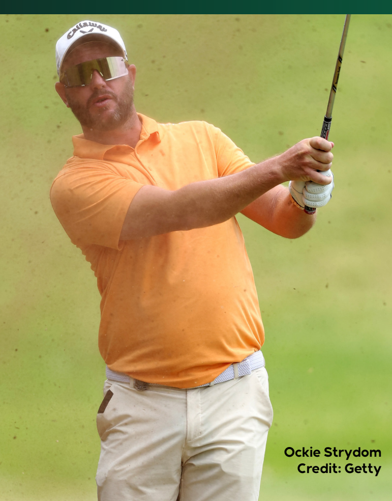
Ockie Strydom