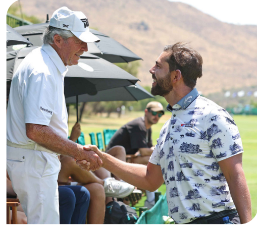
Gary Player shaking hands with Erik van Rooyen.