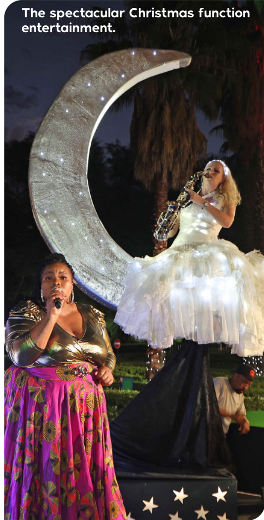
The spectacular Christmas function entertainment.