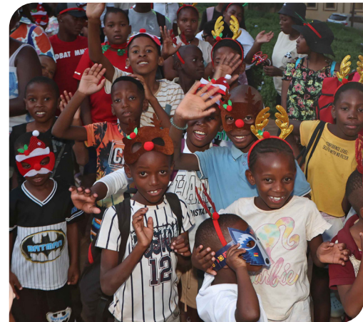
Children at the much anticipated annual Christmas function.