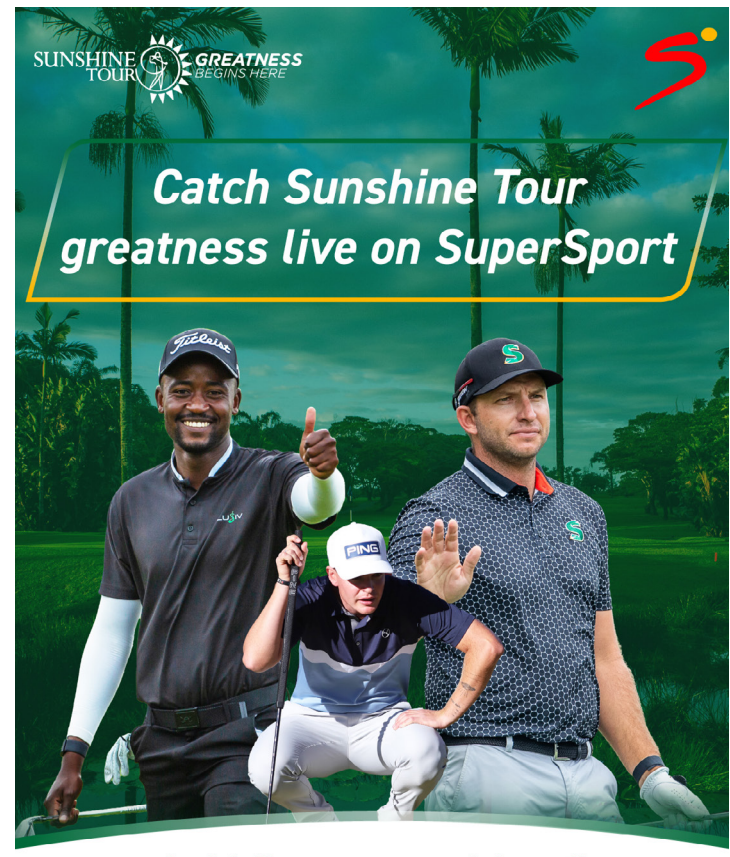
And follow us on social media